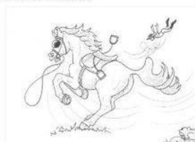
The Panicked Pirouette