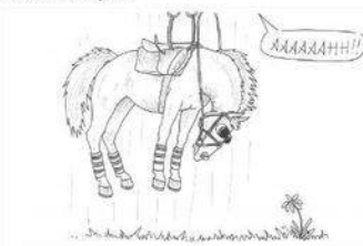
The Vertical Teleport