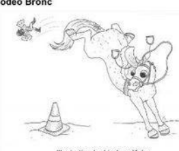
Illustration by Lindsey Kahn