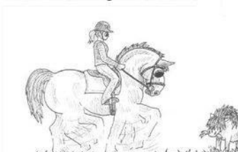
The Grand Prix Dressage Horse Wann